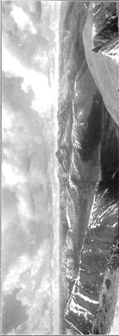
Looking from ridge between Falls creek and north fork of Boswell river across Boswell valley to the Sawtooth range.