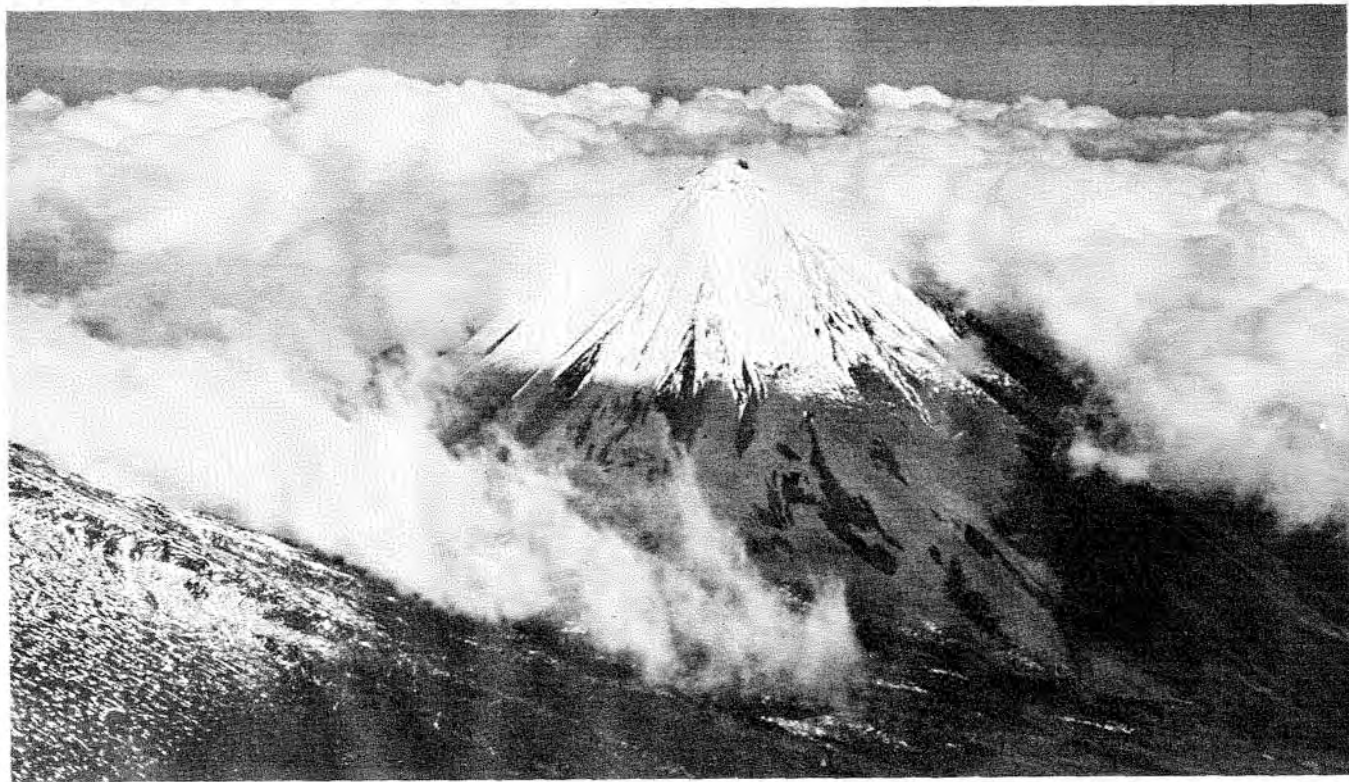
SLIGHTLY DISSECTED CONE OF PAVLOF SISTER.

Crevassed glacier on lower slopes of Pavlof Volcano (left foreground) is covered by ash. Photograph by U. S. Army Air Force, 1942.