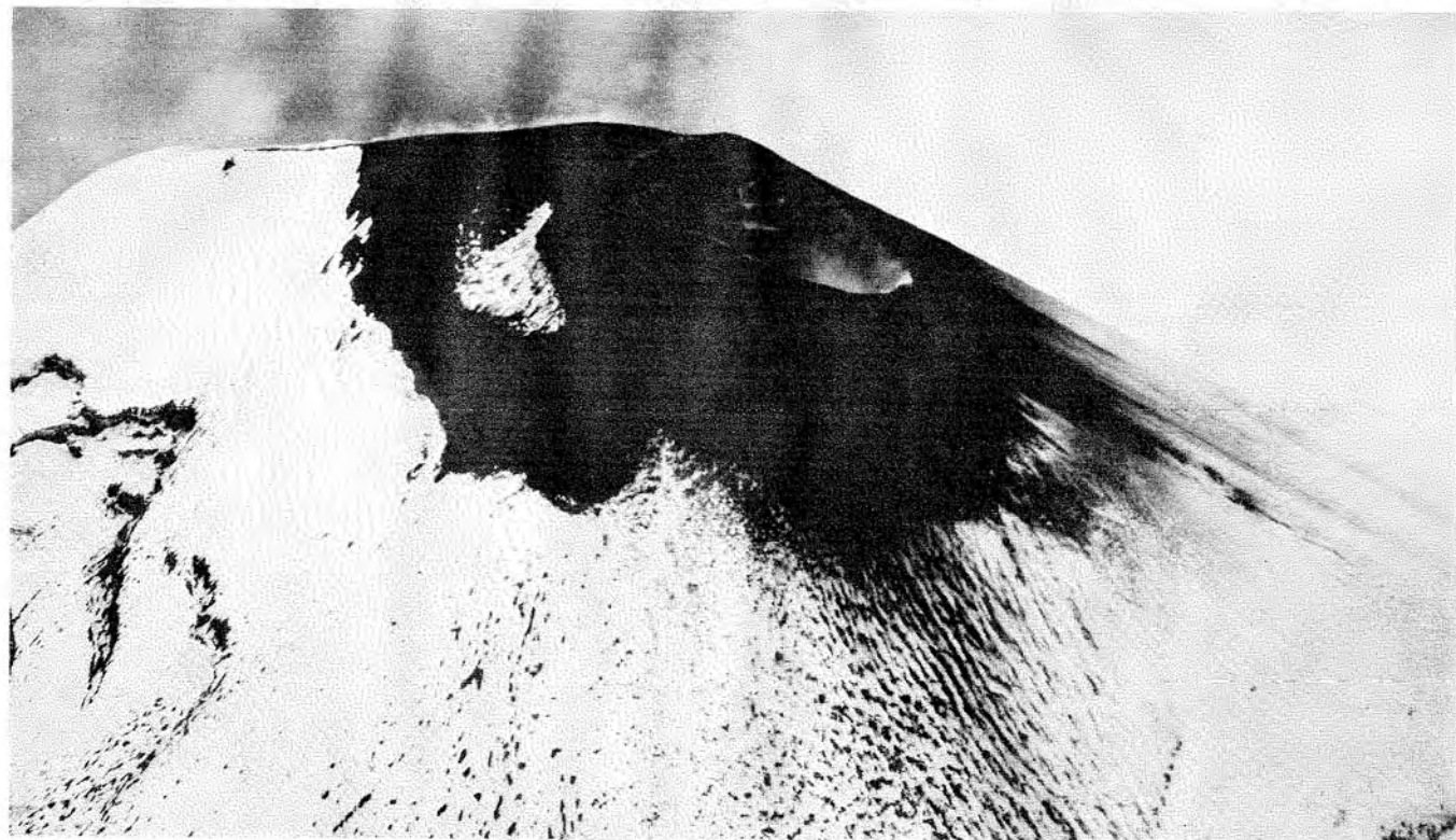
SMALL CRATER ON THE NORTHEASTERN SIDE OF THE SUMMIT OF PAVLOF VOLCANO.

Photograph by U. S. Army Air Force, 1942.