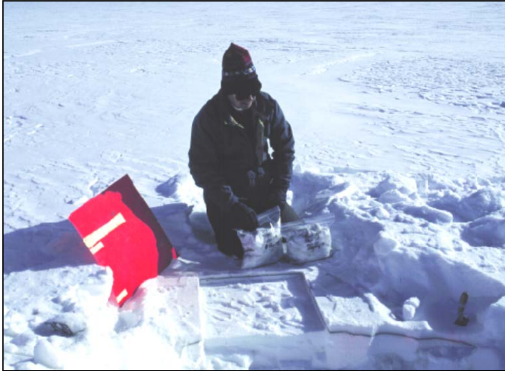
Figure 1. Collection of measured-area ash samples from snow pack after the 1992 eruption of Crater Peak/ Mount Spurr, AK (photo taken on 9/24/92).