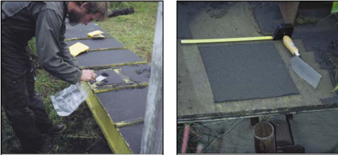
Figure 2. Collection of measured-area tephra samples from hard surfaces after 1992 eruption of Crater Peak/Mount Spurr, AK (photo from 9/21/92).