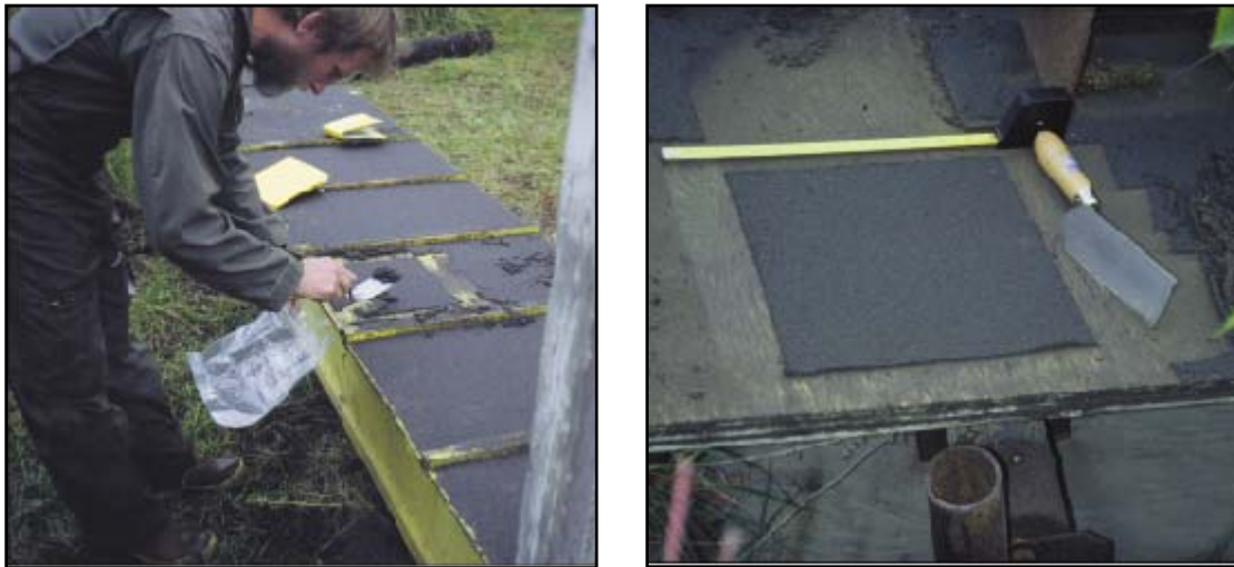
Figure 2. Collection of measured-area tephra samples from hard surfaces after 1992 eruption of Crater Peak/Mount Spurr, AK (photo from 9/21/92).